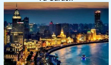
The Bund, Shanghai