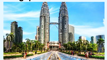
Petronas Twin Towers