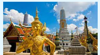
Grand Palace, Bangkok