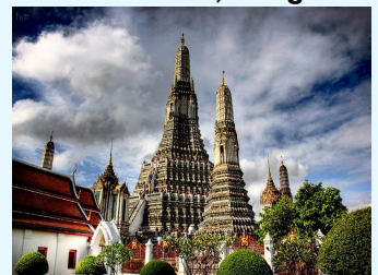
Temple of Dawn

We also offer customized tours for any city or country.