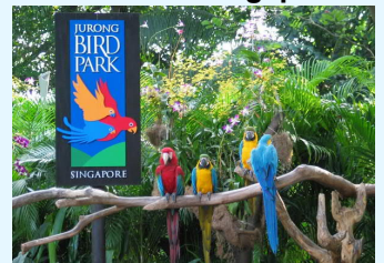
Singapore Bird Paradise