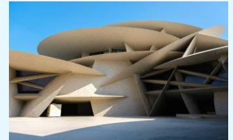
Qatar National Museum

Please contact us with your preferred dates and destinations, and we will reach out with our offer.