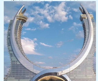
Raffles & Fairmont Hotels