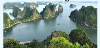
Ha Long Bay