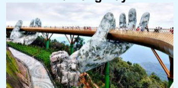
Golden Hands Bridge