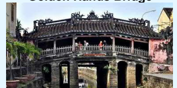
Chua Cau Bridge